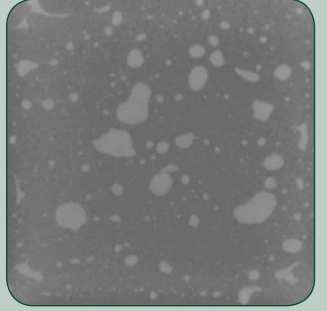
Semiconductor-grade preform tested on Ni/Au coupon