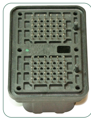
Examples of multi-pin connector components.

This product data sheet is provided for general information only. It is not intended, and shall not be construed, to warrant or guarantee the performance of the products described which are sold subject exclusively to written warranties and limitations thereon included in product packaging and invoices. All Indium Corporation's products and solutions are designed to be commercially available unless specifically stated otherwise.