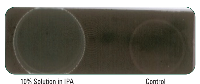
10% Solution in IPA

The J-STD-004B copper mirror test is performed per IPC-TM-650 method 2.3.32. To be classified as an "L" type flux, there should be no complete removal of the mirror surface. CW-219 shows minor removal of the mirror surface, therefore, can be classified as an "M" type flux.